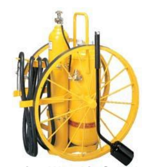
Extension Wand is Standard

Two choices for large volume Class D (flammable metal) protection. Model 680 (Sodium Chloride) is effective on magnesium, sodium, potassium and sodium potassium alloy fires. Model 681 (Copper Powder) designed particularly for fighting difficult lithium fires. Well balanced for quick transport on 36" nonsparking rubber tread steel wheels. Both are pressurized with Argon and regulated to a low 125 psi to avoid disrupting the burning materials.